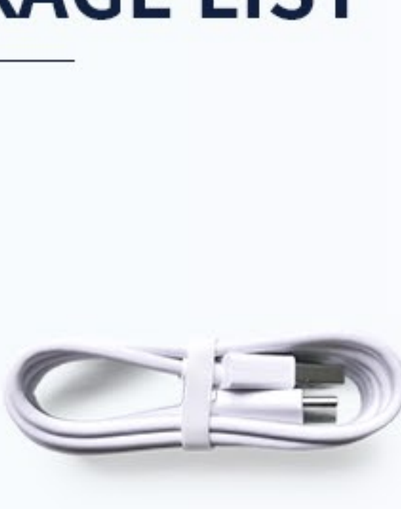
Usb data cable