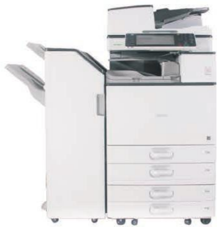
Ricoh MP 3554/5054/6054