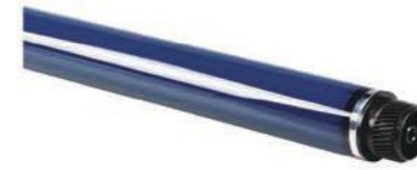
适用理光MP2554/3054/3554/ 4054/5054/6054鼓芯 Suitable for Ricoh MP2554 / 3054/3554/ 4054/5054/6054 drum core