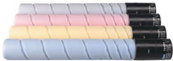
适用柯美耗材 Suitable for Konica Minolta Consumables