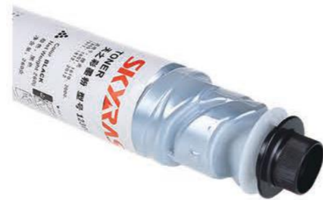
MP2014C适用理光MP2014/2014D/2014AD碳粉 MP2014C Suitable for Ricoh MP2014 / 2014D / 2014AD toner