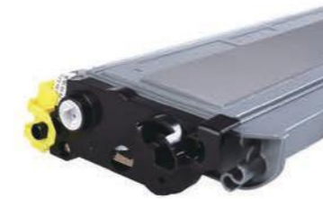
SP-KR1200C适用理光SP1200U粉盒 SP-KR 1200C Suitable for Ricoh SP 1200U toner cartridge