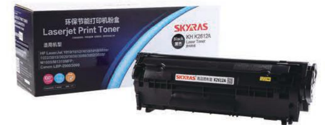
适用理光KH K2612A粉盒 Suitable for Ricoh KH K2612A toner cartridge