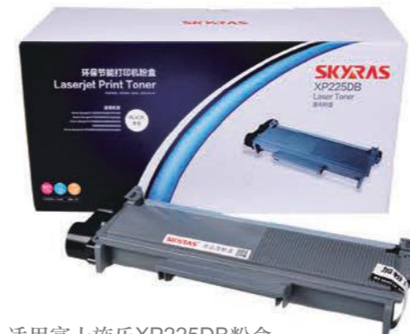
适用富士施乐XP225DB粉盒 Suitable for Fuji Xerox XP225DB toner cartridge