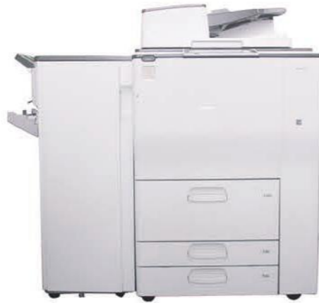
Ricoh MP 6503-7503-9003