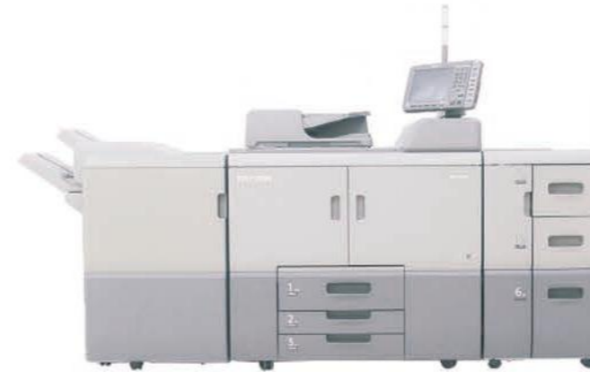
Ricoh Pro 8100/8110/8120