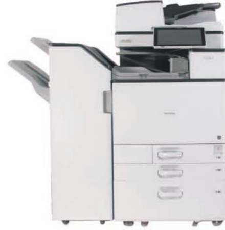
Ricoh MP C2504/3504/4504/6004