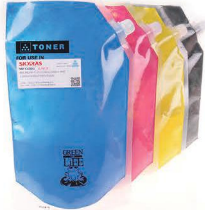
适用理光03系列彩机袋装耗材 Suitable for Ricoh 03 Series Color Machine Bagged Consumables