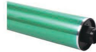
适用理光鼓芯 Suitable for Ricoh drum core