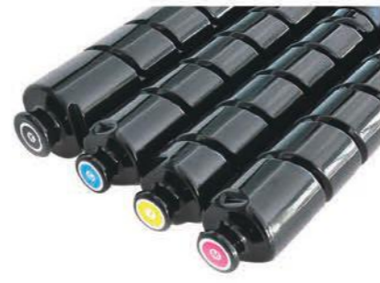
适用佳能彩色复印机碳粉 Suitable for Canon Color toner