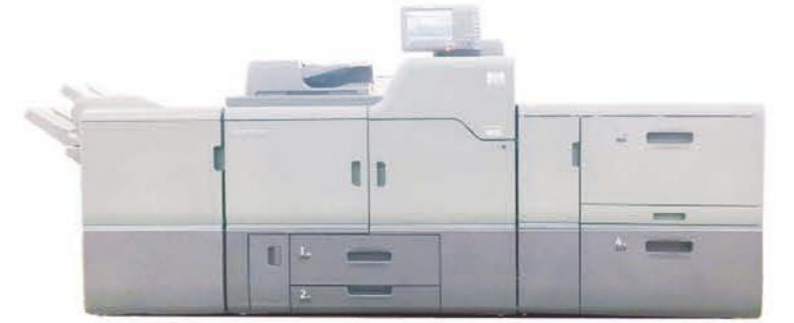
Ricoh Pro C7100/S/X/SX C7110/S/X/XS