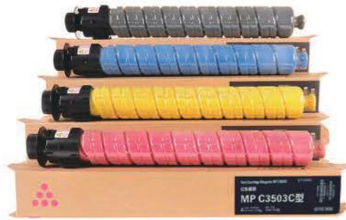
适用理光MPC3503 5503 6003 SP彩色碳粉 Suitable for Ricoh MPC3503 5503 6003 SP Color toner

Ricoh, Canon, Konica Minolta Consumables