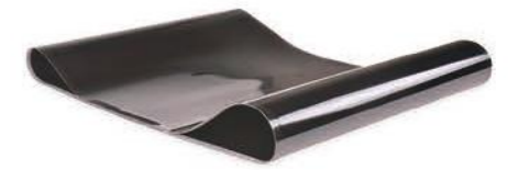
适用理光MPC2500 3300 3502 4500 5000 5501 5502转印膜 Suitable for Ricoh MPC2500 3300 3502 4500 5000 5501 5502 transfer film