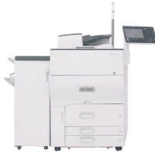
Ricoh Pro C5100/5110s