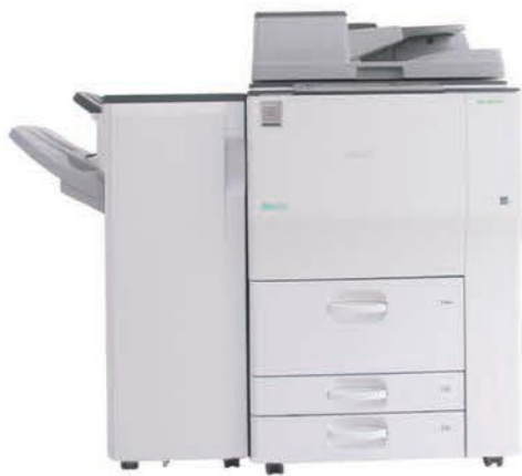
Ricoh MP 7502-9002