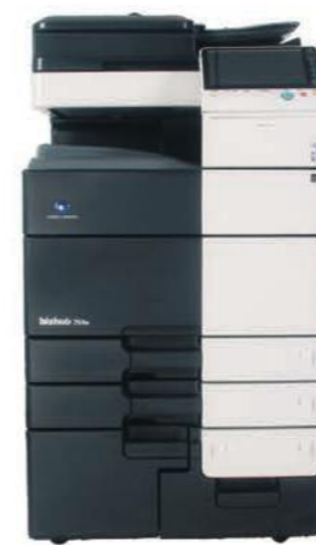
Konica Minolta BH 654/754 Konica Minolta BHC654/754