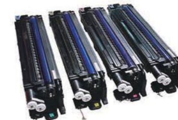
适用理光MPC2003 2503 3003 3503 4503 5503 6003定影器原装组件 Suitable for MPC2003 2503 3003 3503 4503 5503 6003 original components of Ricoh fuser