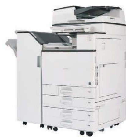
Ricoh MP C2503/3503/5503/6003