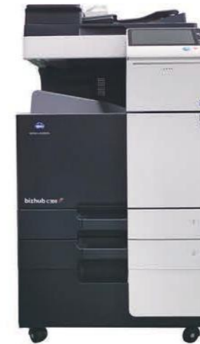
Konica Minolta BH 308/368 Konica Minolta BHC308/368