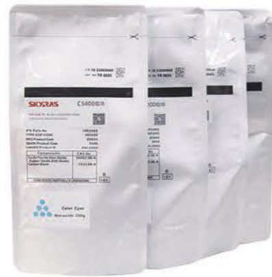
适用理光载体 Suitable for Ricoh Developer