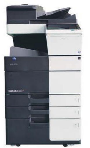
Konica Minolta BH 458/558 Konica Minolta BHC458/558