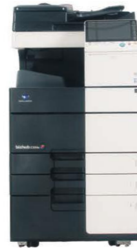
Konica Minolta BH 364/454/554 Konica Minolta BHC364/454/554