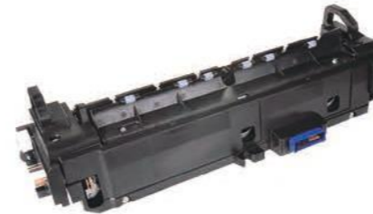
适用理光MPC2003 2503 3003 3503 4503 5503 6003定影器原装组件 Suitable for MPC2003 2503 3003 3503 4503 5503 6003 original components of Ricoh fuser