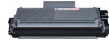
XP225适用富士施乐225DW粉盒 XP225 Suitable for Fuji Xerox 225DW toner cartridge